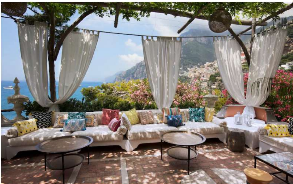
Treville Positano is the former home of Franco Zeffirelli

Treville Positano (00 39 089 812 2401) offers doubles from £675 on a B&B basis. Plan the perfect holiday on the Amalfi Coast with our guide.