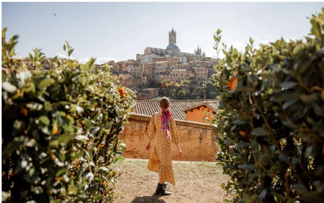
Italy's cities and countryside continue to captivate British holidaymakers